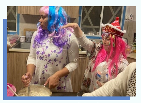
immensely grateful for your continued partnership.

This transformation not only enhances the overall ambiance but also provides a conducive environment for our students to develop and deepen their understanding of Jewish traditions and foster a sense of community. Your support has played a significant role in making this dream a reality, and we are