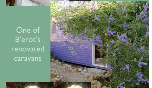
One of B'erot's renovated caravans